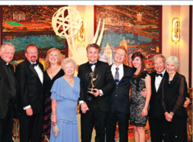
Celebrating the win with Healthy Visions.