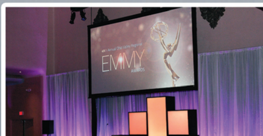
Facing Life Head-On received two Emmy® nominations at the 49th Annual Ohio Valley Regional Emmy® Awards ceremony.